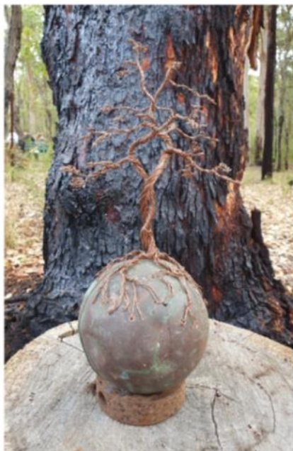
Exquisitely fashioned plant forms contradicting and yet balancing the raw found objects on which they are fixed.

This event is hosted by a volunteer subcommittee of the Porongurup Community Association Inc. (PCA).