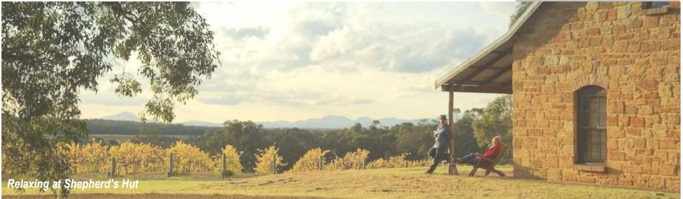
Relaxing at Shepherd's Hut

Tuesday night 'Art Hang' 6.30 pm continues at the Tearooms, no experience required.