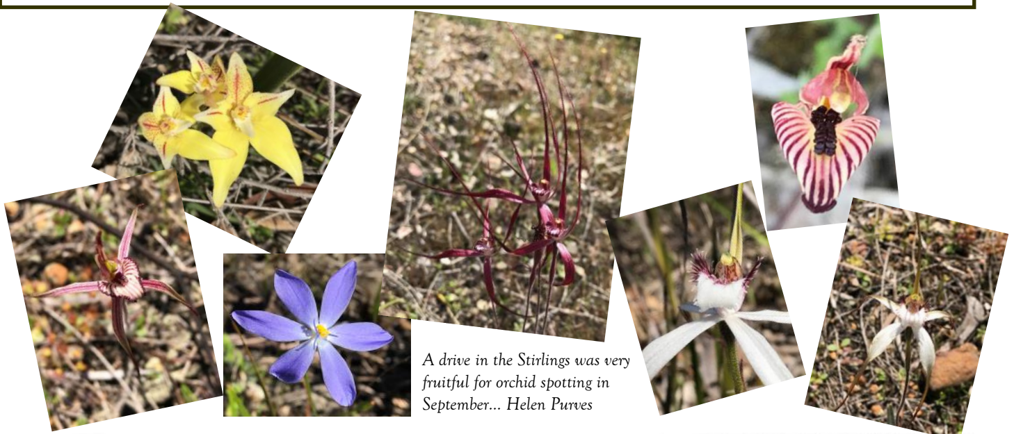
A drive in the Stirlings was very fruitful for orchid spotting in September... Helen Purves