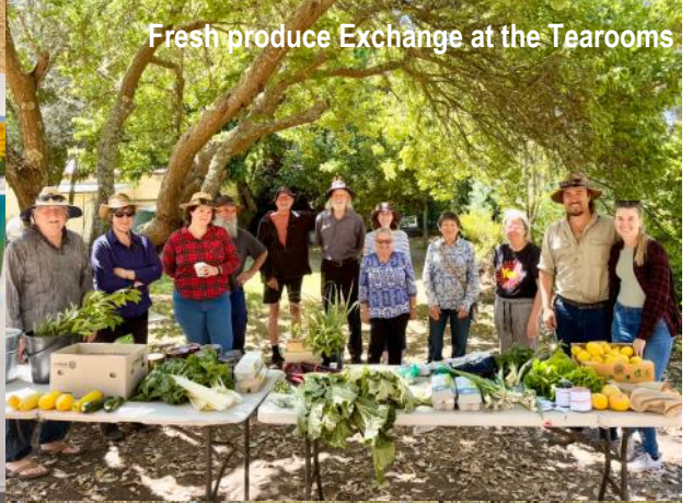
Fresh produce Exchange at the Tearooms