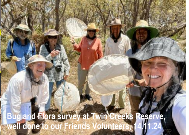
Bug and Flora survey at Twin Creeks Reserve, well done to our Friends Volunteers, 14.11.24