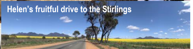
Helen's fruitful drive to the Stirlings