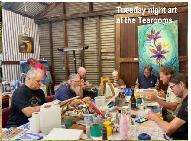
Tuesday night art at the Tearooms